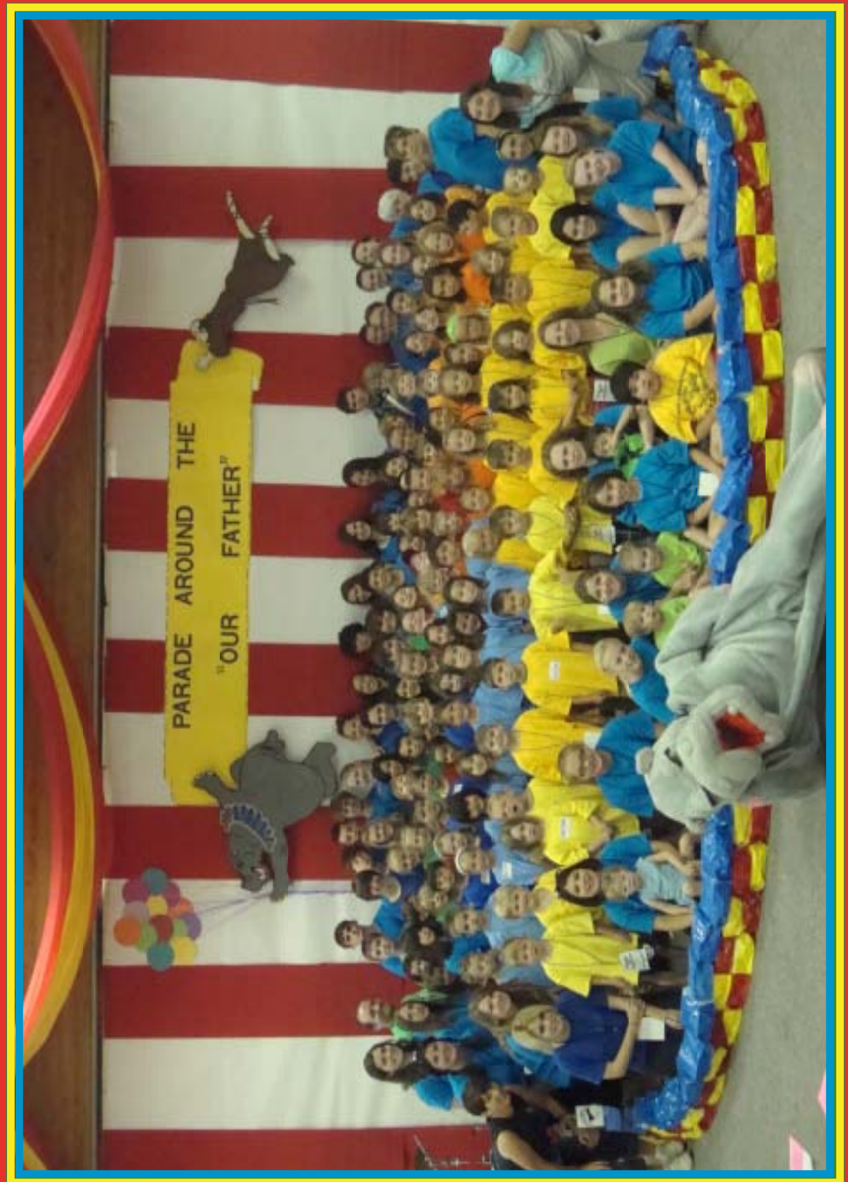
Vacation Bible School 2010 Parade Around the "Our Father"