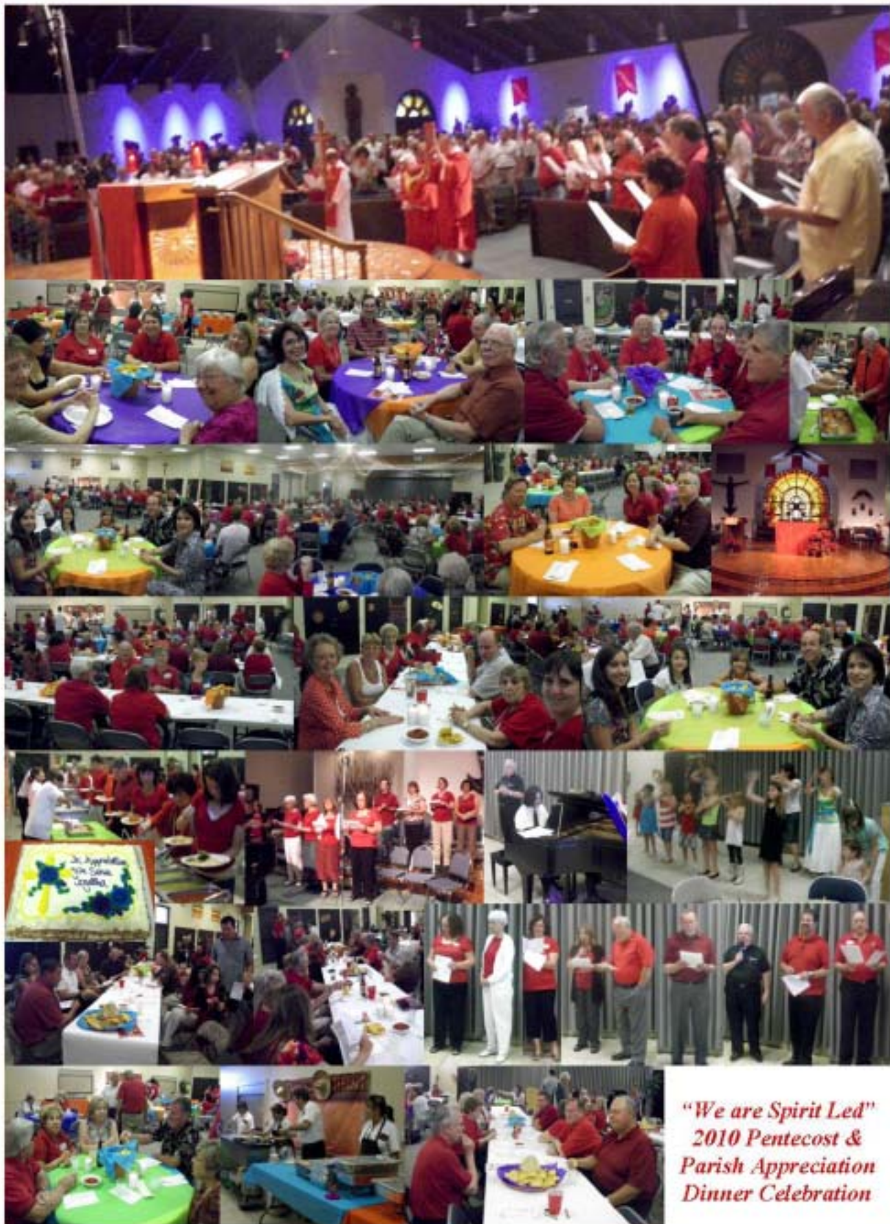
"We are Spirit Led" 2010 Pentecost & Parish Appreciation Dinner Celebration