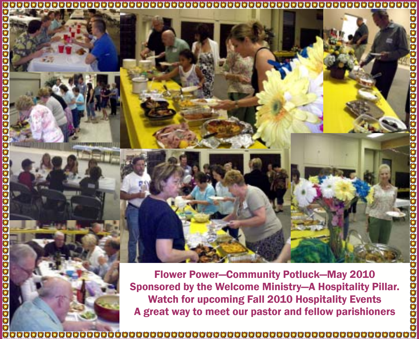
Flower Power—Community Potluck—May 2010 Sponsored by the Welcome Ministry—A Hospitality Pillar. Watch for upcoming Fall 2010 Hospitality Events A great way to meet our pastor and fellow parishioners